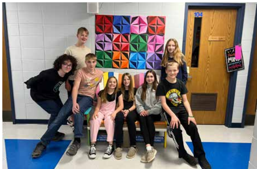
Middle schoolers show off their collaborative artwork in the hallway. Students painted vector squares using tints and tones of one hue.