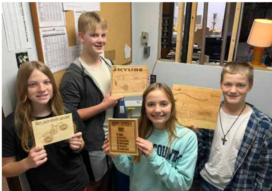
Students designed graphics in Adobe Illustrator and learned to format & send graphics to be engraved on wood.