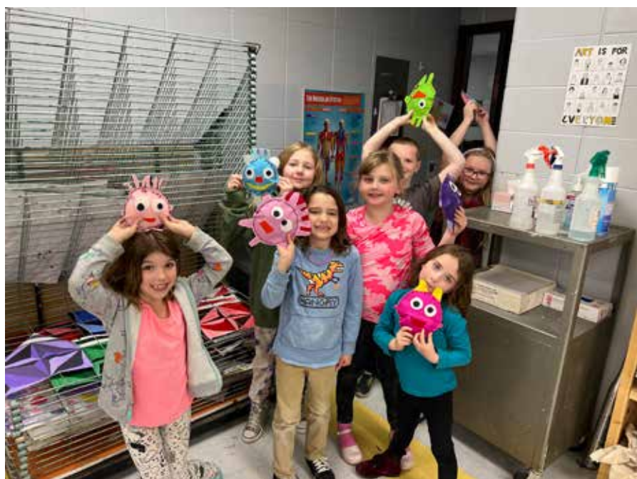
Elementary students are excited to take home their sewn stuffed monsters.