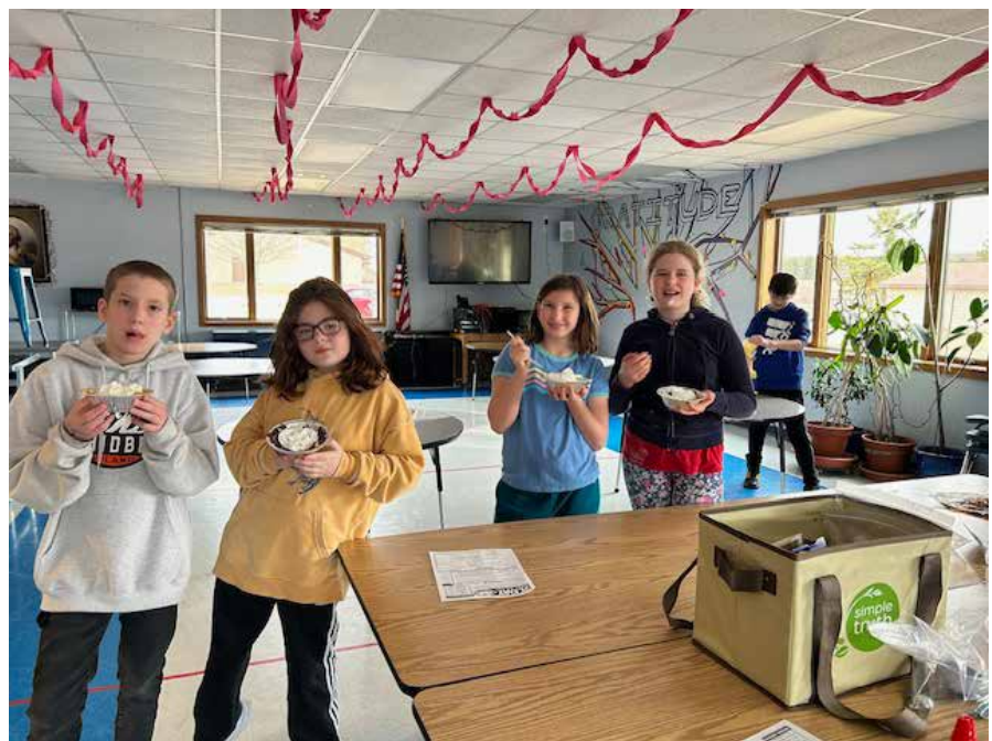
5th Graders enjoying their tasty pie!